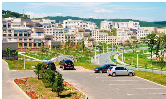
Federal University in Russky Island

The city has seven theaters, including Primorsky Opera and Ballet Theatre opened in 2013 and a circus. Svetlanskaya Street with building of the second half of the 19th century is an architectural gem of the city centre. Two giant cable-stayed bridges were constructed in Vladivostok, namely the Zolotoy Rog Bridge over the Golden Horn Bay in the center of the city, and the Russky Bridge from the mainland to Russky Island, where the summit APEC Russia-2012 took place. The latter bridge is the longest cable-stayed bridge in the world. Sights of the city are also funicular, churches, railway station. Please find more information about the city on Wikipedia http://ru.wikipedia.org , website of Primorsky Territory Administration http://primorsky.ru/Vladivostok and http://www.vl.ru/ .