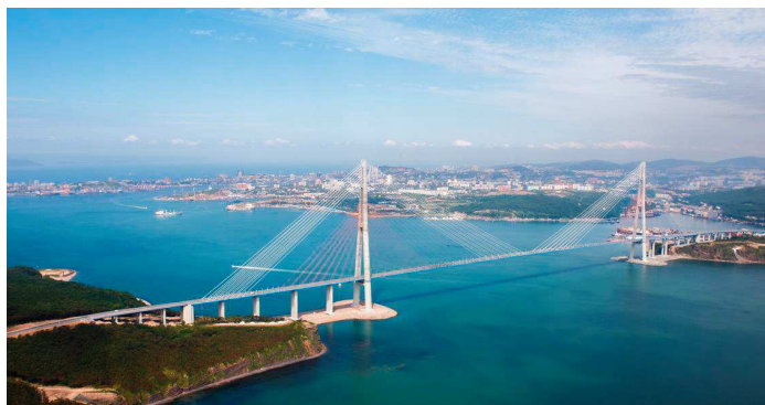
Russky Bridge from the mainland to Russky Island

Vladivostok is a major cultural center of the Russian Far East. The Primorsky State Arsenyev` Museum in Vladivostok is the largest and the oldest museum in Primorye leading its history from the Museum of the Society for Study of the Amur Region. Of great interest are Seaworld, Submarine Museum S-56 and others, in particular, the Scientific and Educational FEFU (Federal University) Museum, Primorye Regional Art Gallery, museums of the FANO institutions.