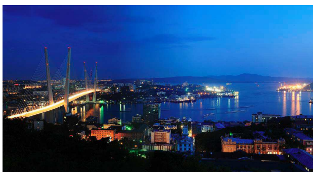
Zolotoi Rog Bridge

Vladivostok is a major cultural center of the Russian Far East. The Primorsky State Arsenyev` Museum in Vladivostok is the largest and the oldest museum in Primorye leading its history from the Museum of the Society for Study of the Amur Region. Of great interest are Seaworld, Submarine Museum S-56 and others, in particular, the Scientific and Educational FEFU (Federal University) Museum, Primorye Regional Art Gallery, museums of the FANO institutions.